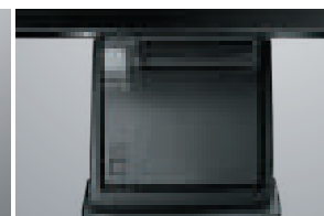
Flexibility to Integrate Receipt Printers of Your Choice