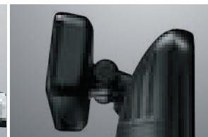
Modular Customer Display